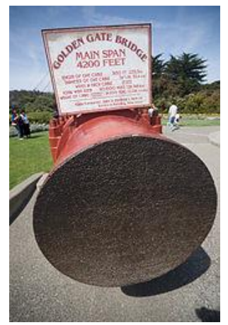
The weight of the roadway is hung from two cables that pass through the two main towers and are fixed in concrete at each end. Each cable is made of 27,572 strands of wire. There are 80,000 miles (130,000 km) of wire in the main cables.

People of God TRAVEL GOSPEL Bridge – Safely Suspended by 2 Epiphanies NOT an Option > Wanna get to Other Side > Travel Across Suspended Bridge Rest of TITUS 2 > WHO are those Given GRACE & GLORY from Great God? Sound Doctrine = What we BELIEVE AND How we BEHAVE How to be a CHRISTIAN and Not a CRETAN